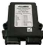
Seatbelt Monitoring System