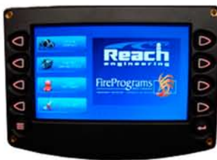
View 2 XL CAN based Color Display Video Input