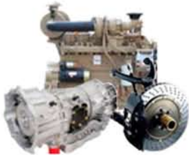
Chassis CAN bus Engine, Trans and ABS