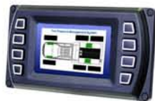
View 2 LT CAN based Compact Form Full Color Display