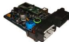
Vehicle Multiplex Circuits